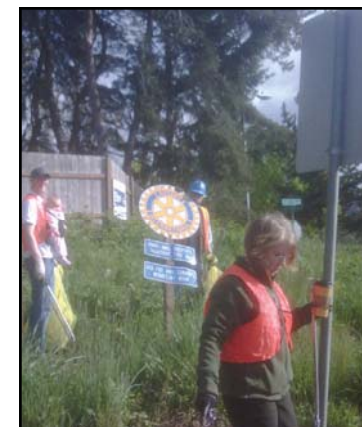
Newberg Early Birds