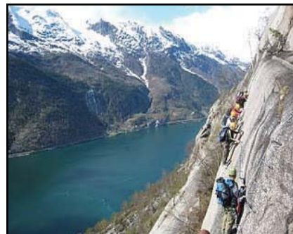
Above: Hardanger Fjord and the Via Ferrata "Hike"