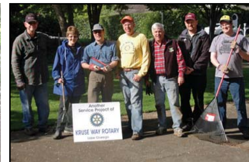
Kruse Way-Lake Oswego